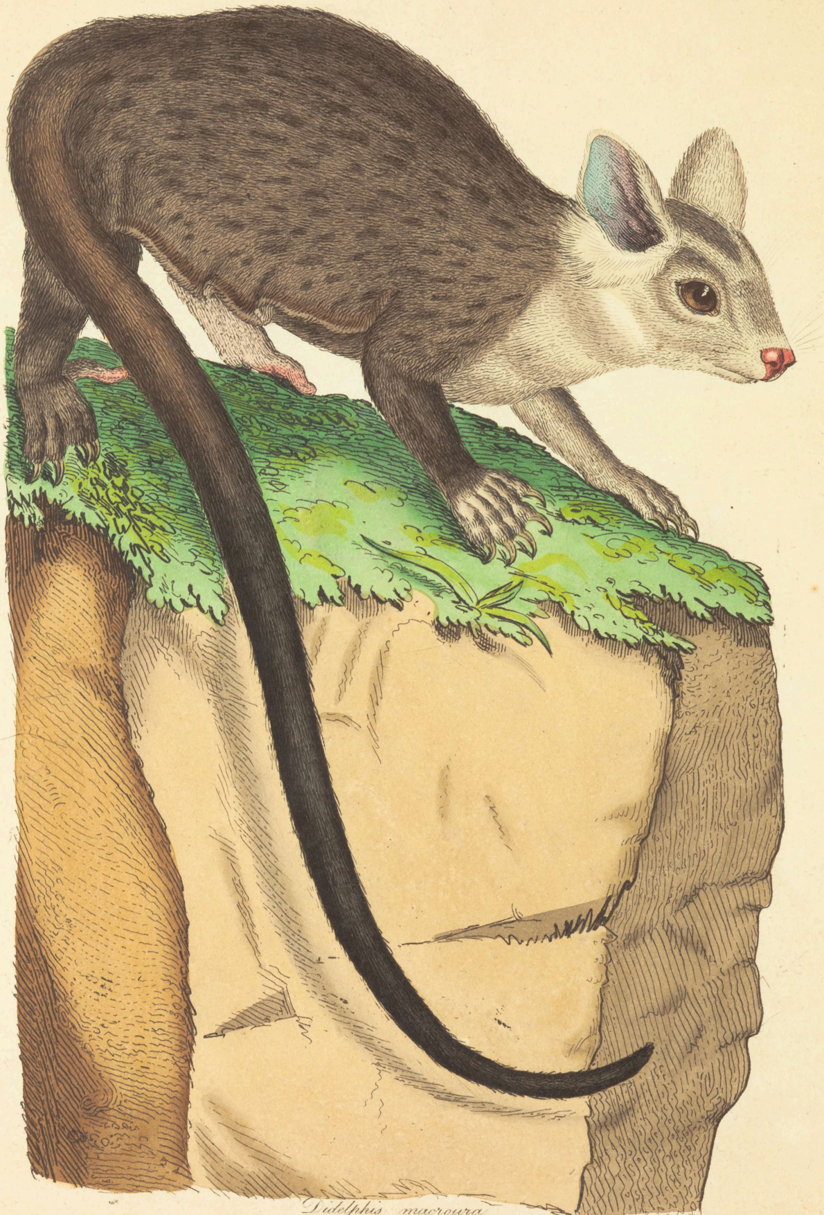
Dipolphis macroura Engraved by Jas. Sowerby, Nov. 1. 1791.